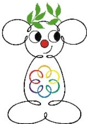
Delphix – the IDC Mascot