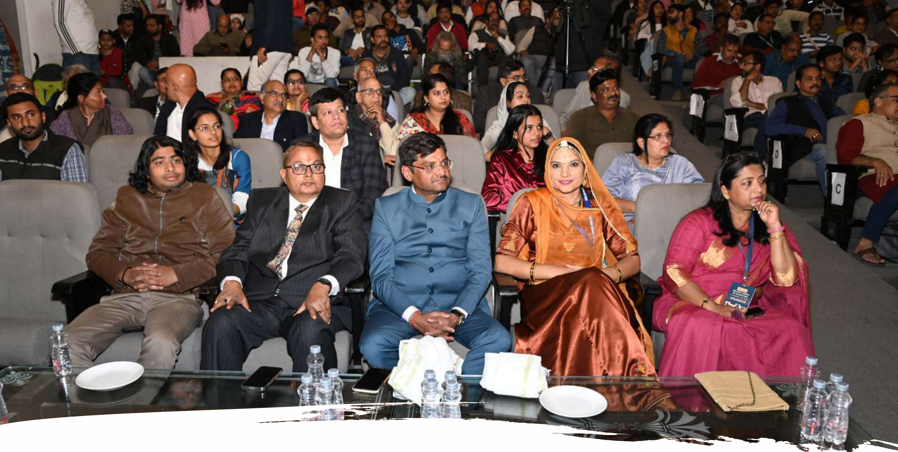
Full House at the Closing Ceremony of Delphic Games of Rajasthan