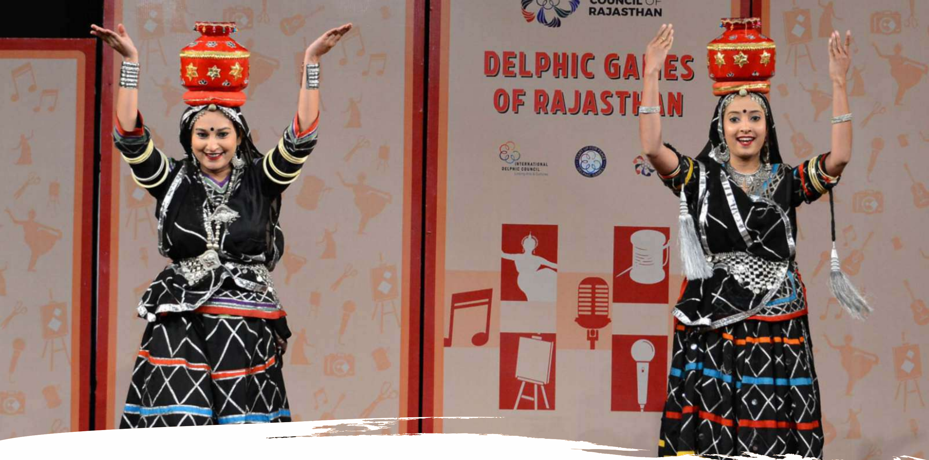
Artist Performing in Folk Dance Category