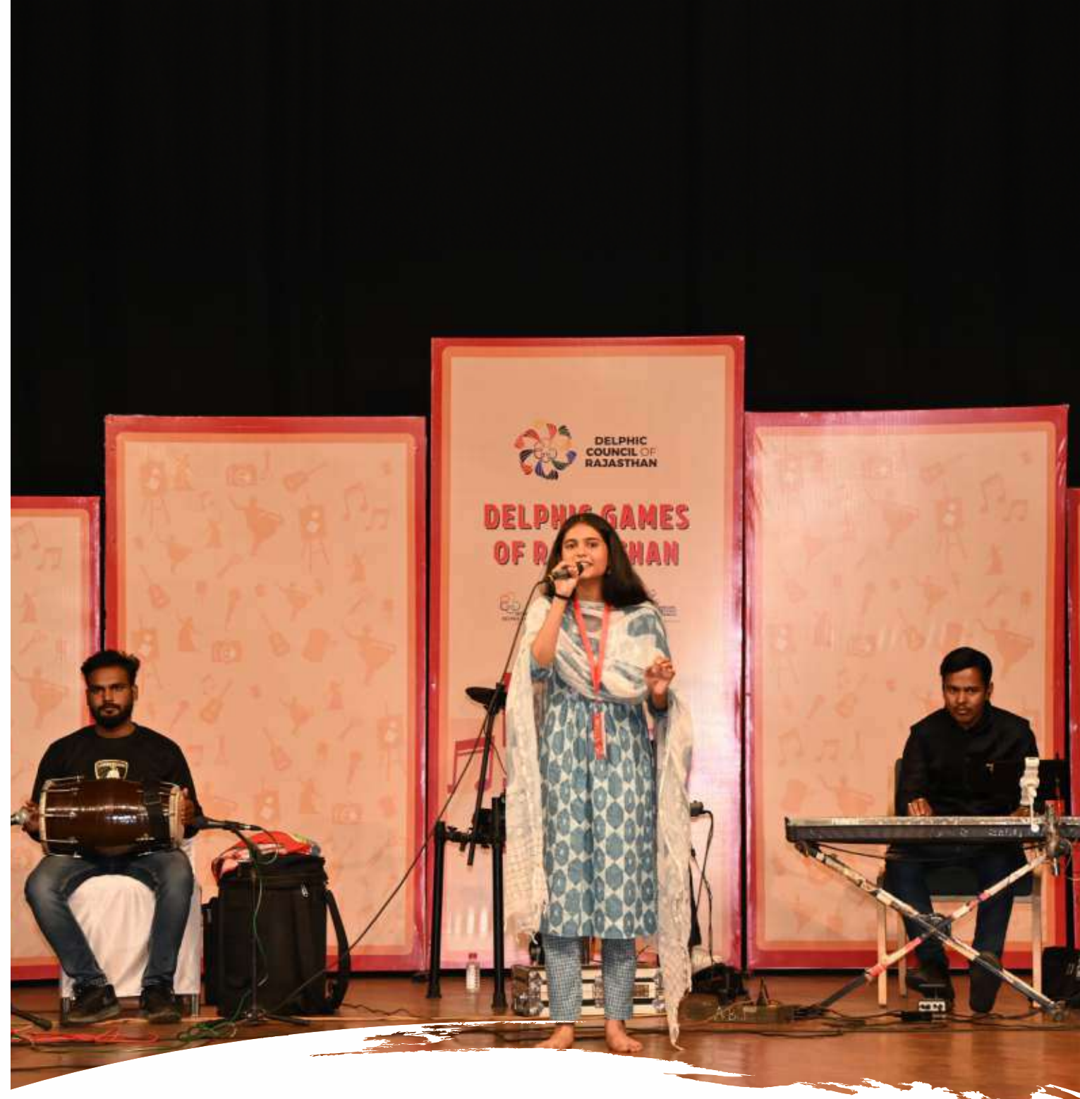
Artist Performing in Indian Film Music Category