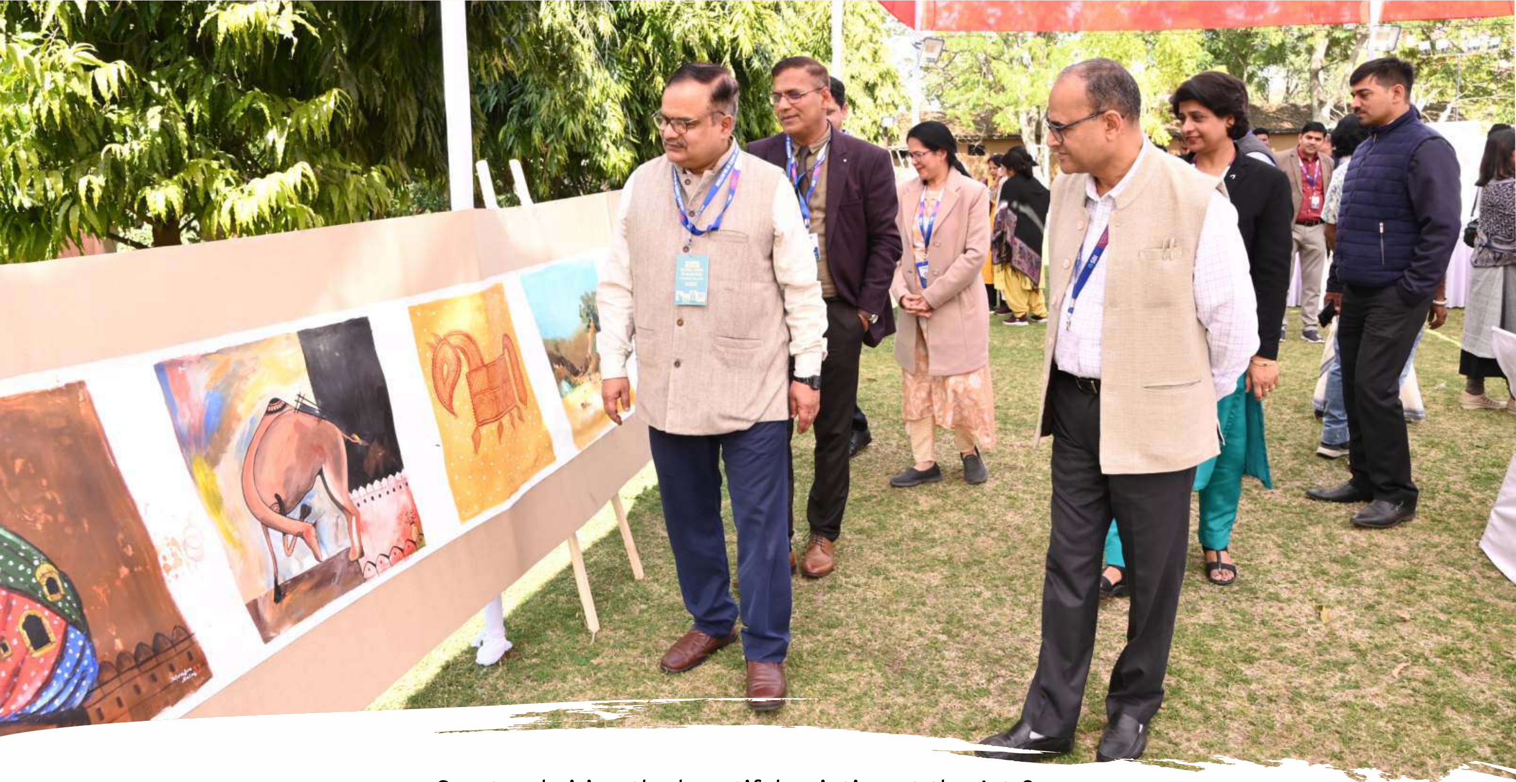
Guests admiring the beautiful painting at the Art Camp