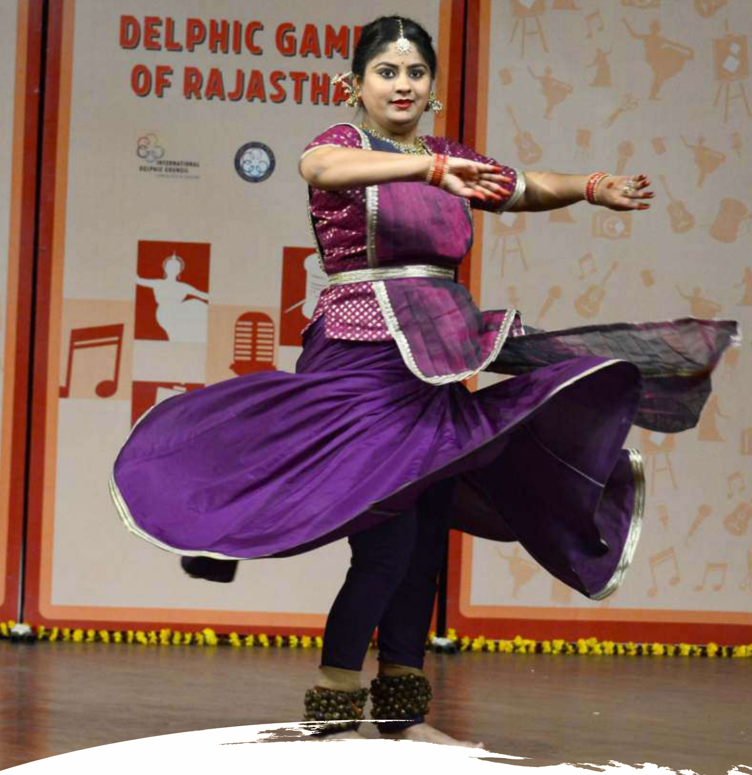
Artist Performing in Classical Dance Category