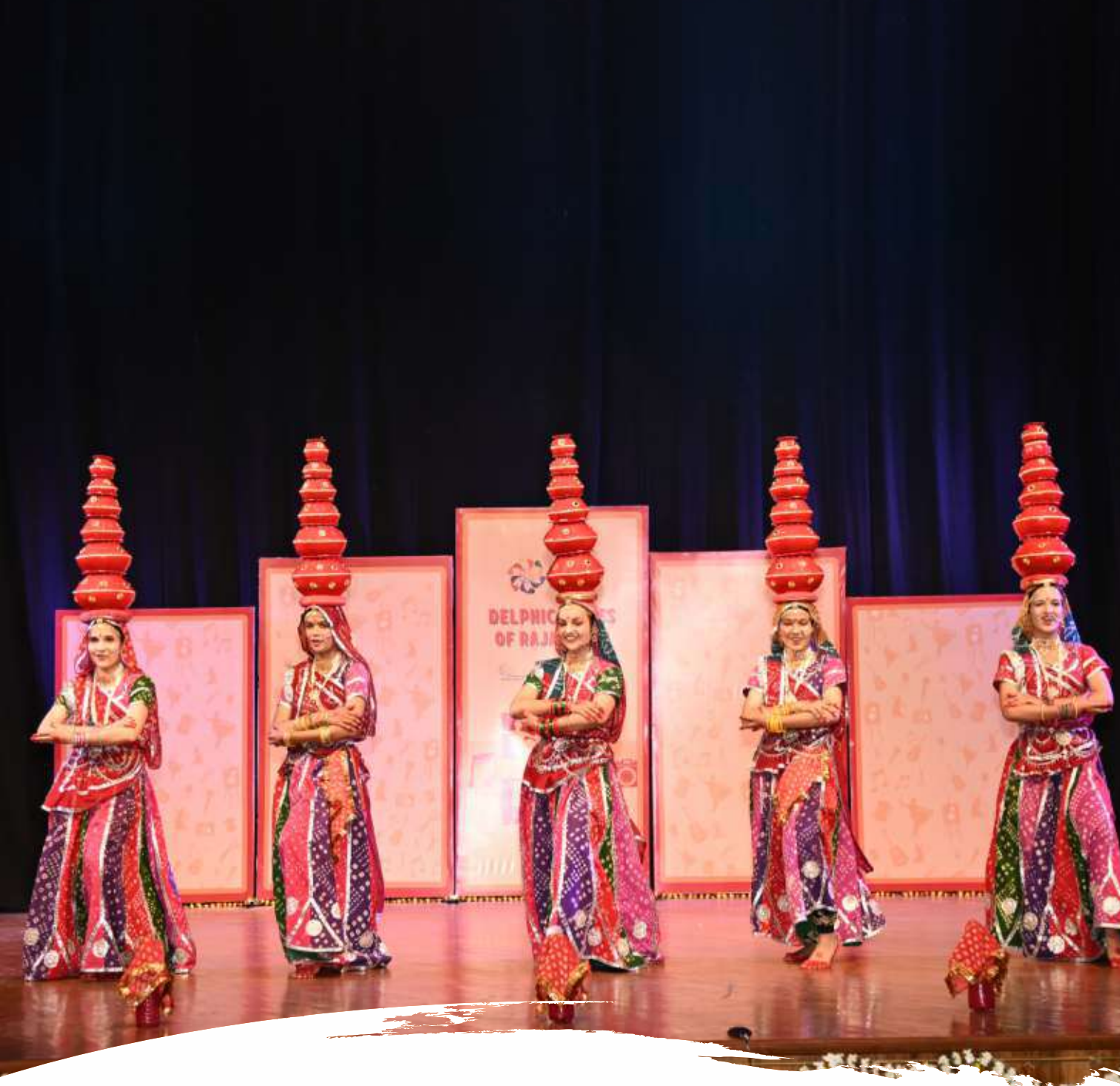
Winner of Each Category Performed in the Closing Ceremony