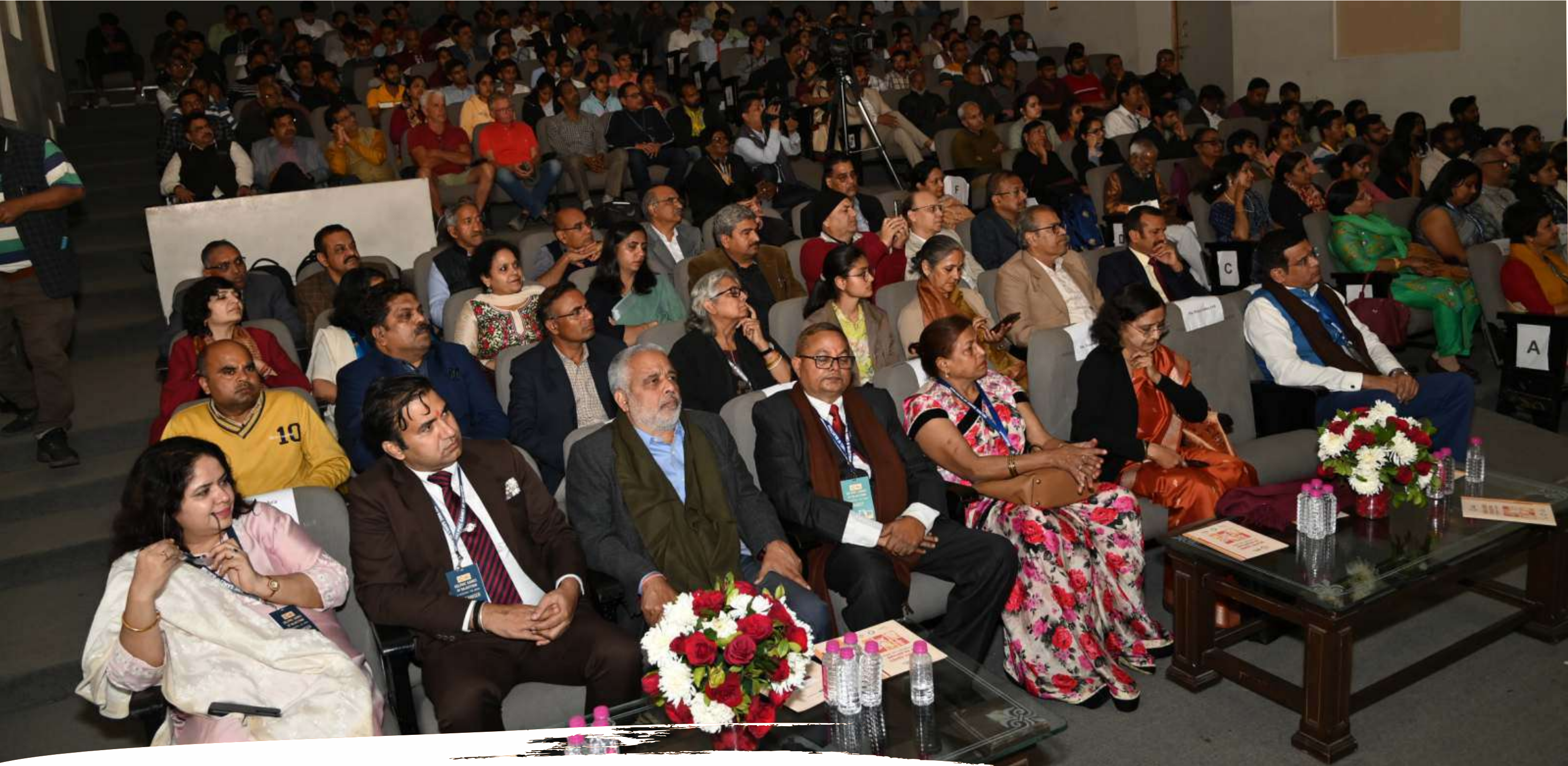
Full House at the Opening Ceremony of Delphic Games of Rajasthan