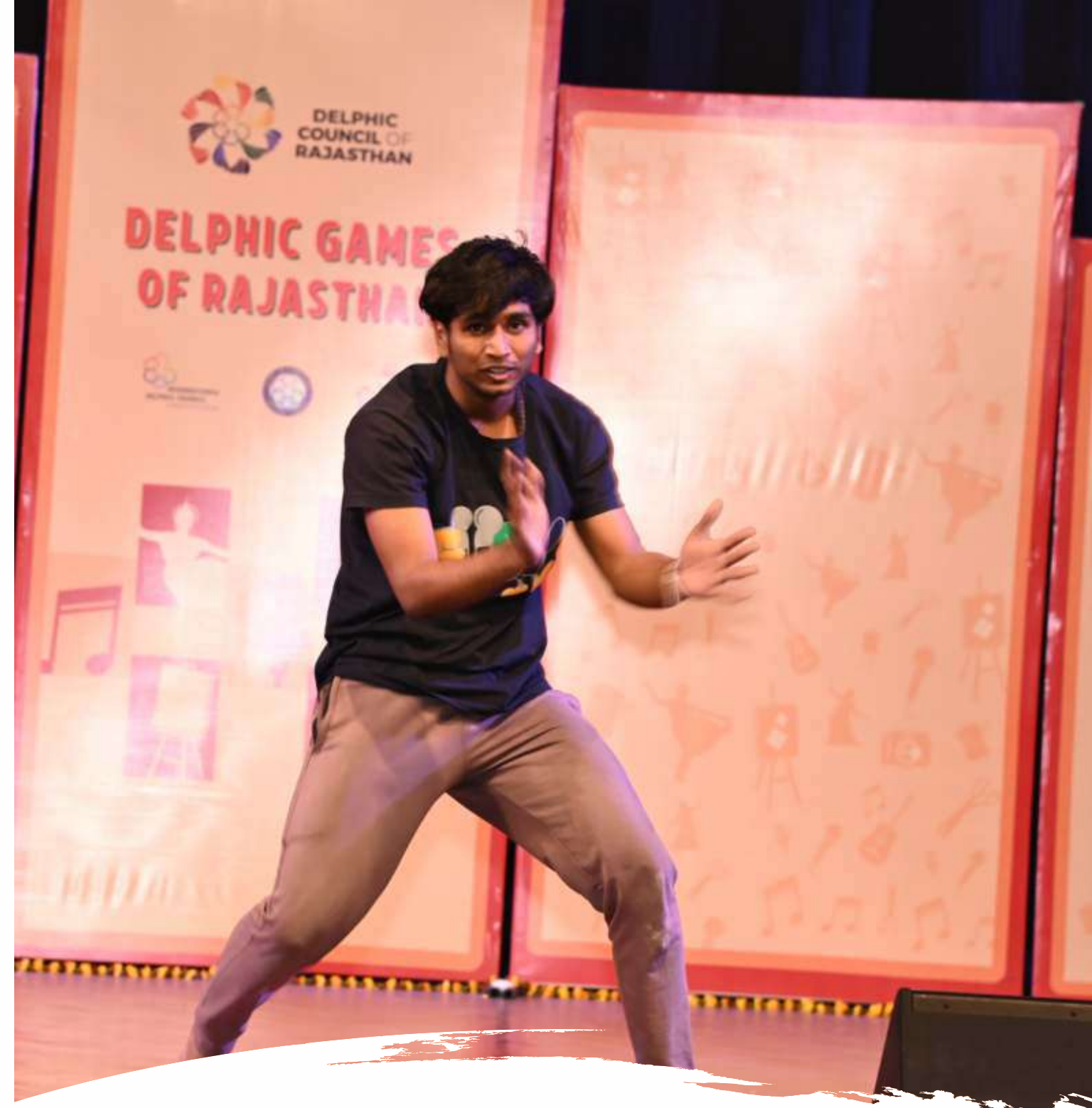
Artist Performing in Contemporary Dance Category