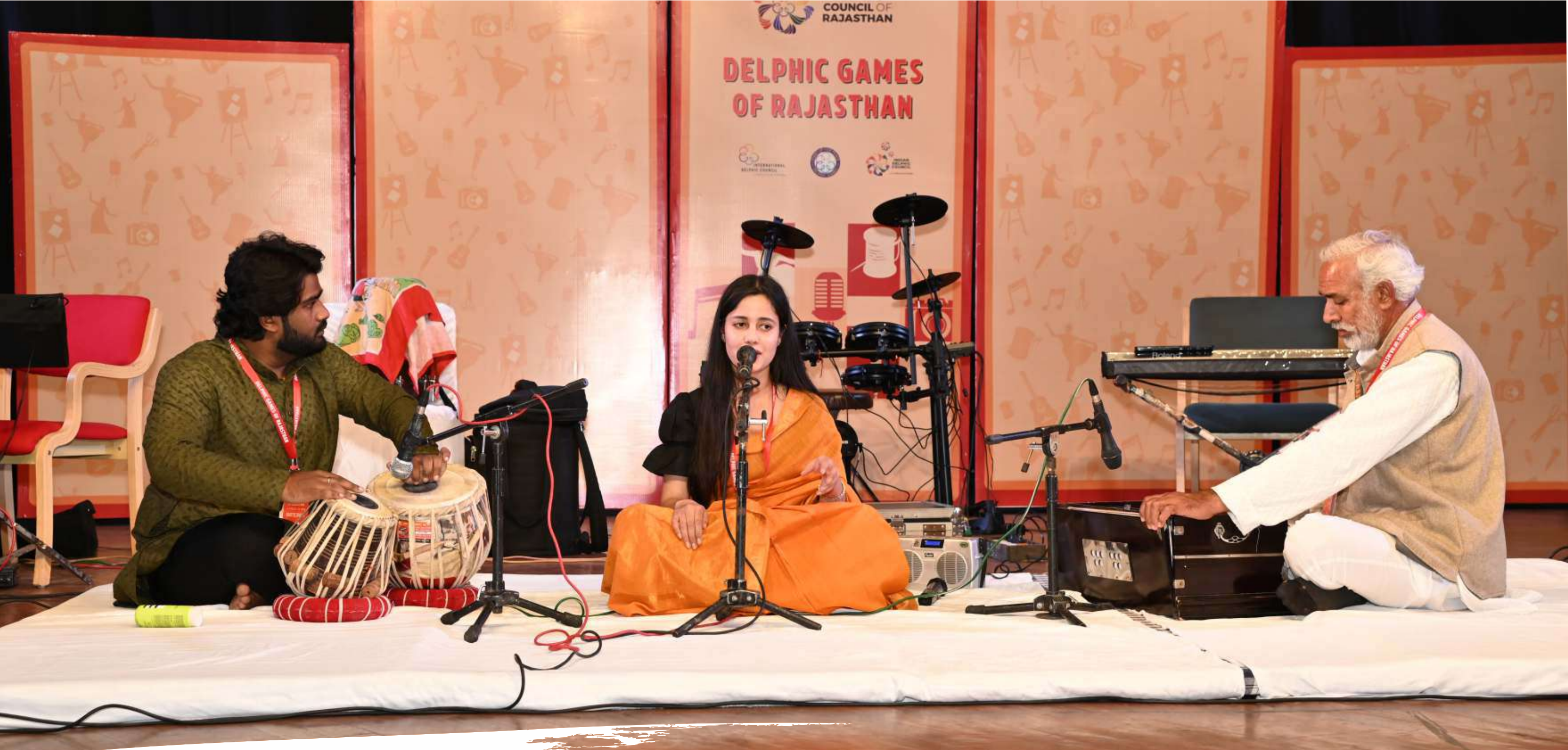
Artist Performing in Indian Classical Music Category