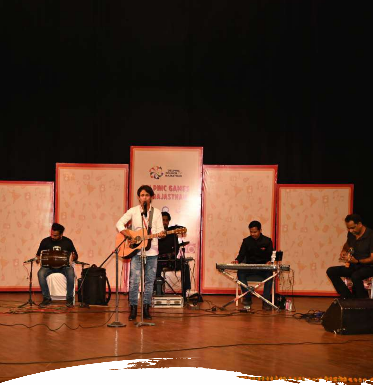
Artist Performing in the Pop Music Category